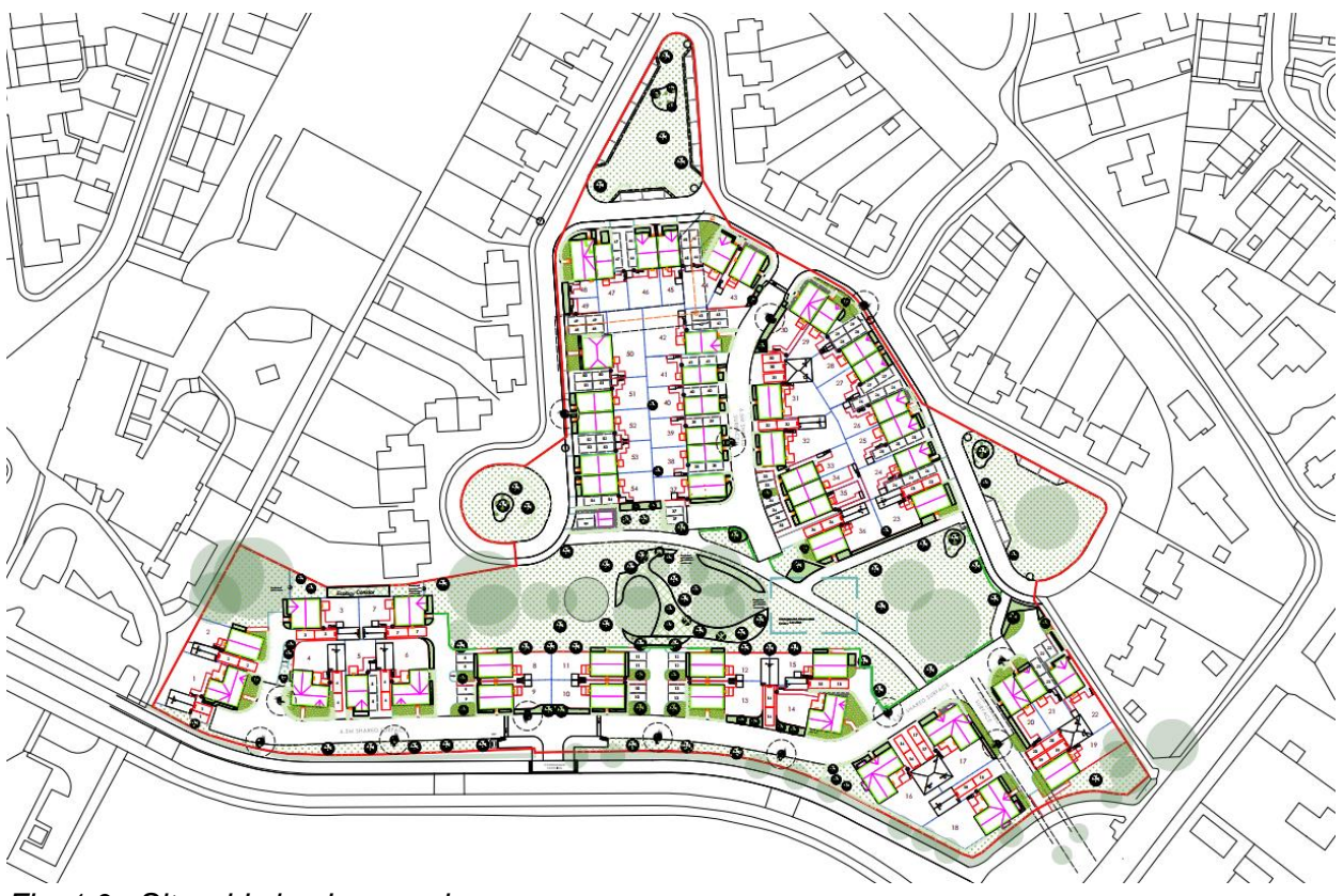
Fig. 1.0 - Site wide landscape plan

The development will provide 30% affordable housing as per the requirements for this area and as approved at the outline stage. This will be made up of 1, 2, 3 and 4 bed properties, with the predominant mix being 2 and 3 bed properties.